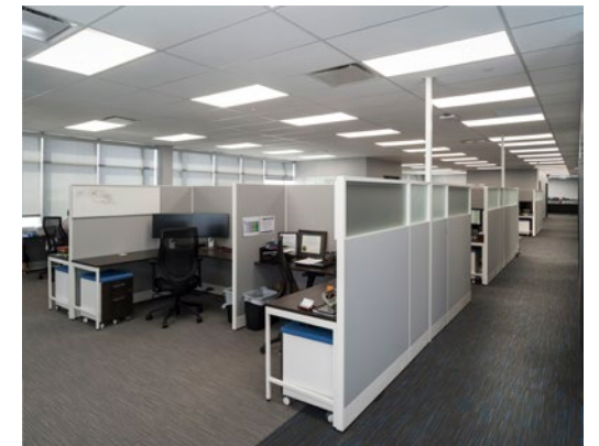
The QEMT I building in Nisku.

Tree Time Services: This company puts seedlings in cold storage and ships them out for restoration projects in the spring. Kemway needed to retrofit the building by creating an 8,000 square foot freezer for the seedlings. This had to be done during a very narrow window – take too long and the seedlings would not have a place to live after being harvested. Despite long delivery times on equipment, Kemway expertly scheduled and coordinated the project and finished it in time for harvest. The project was completed in an astonishing 30 days.